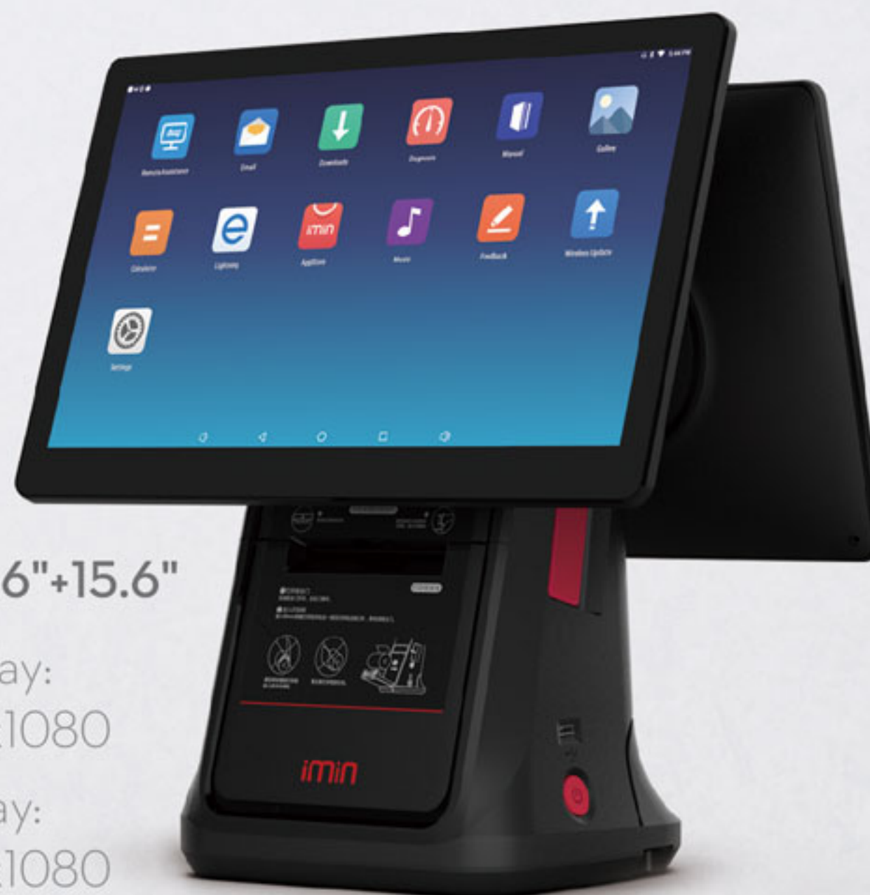
Display 15.6"+15.6" Main Display: 15.6" 1920x1080 Vice Display: 15.6" 1920x1080