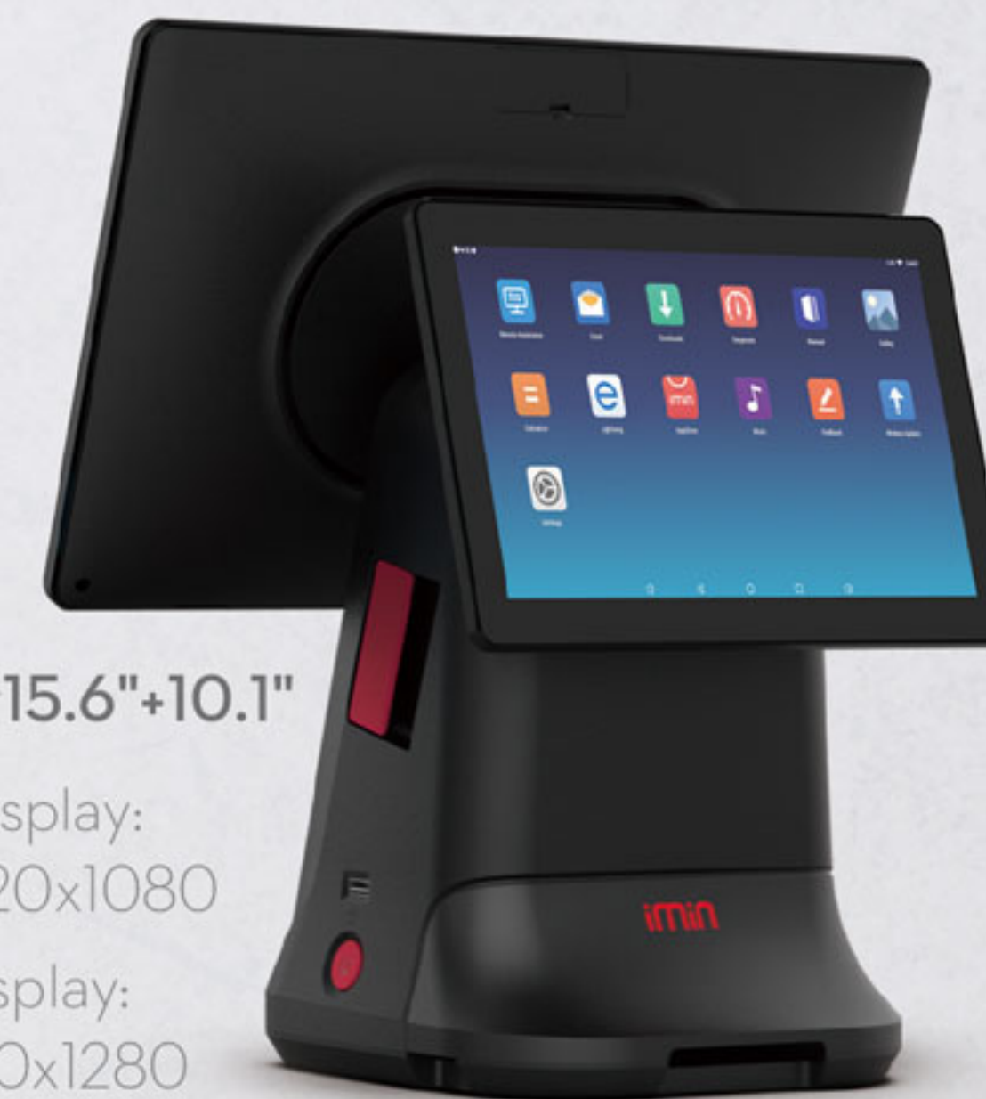
Display 15.6"+10.1" Main Display: 15.6" 1920x1080 Vice Display: 10.1" 800x1280