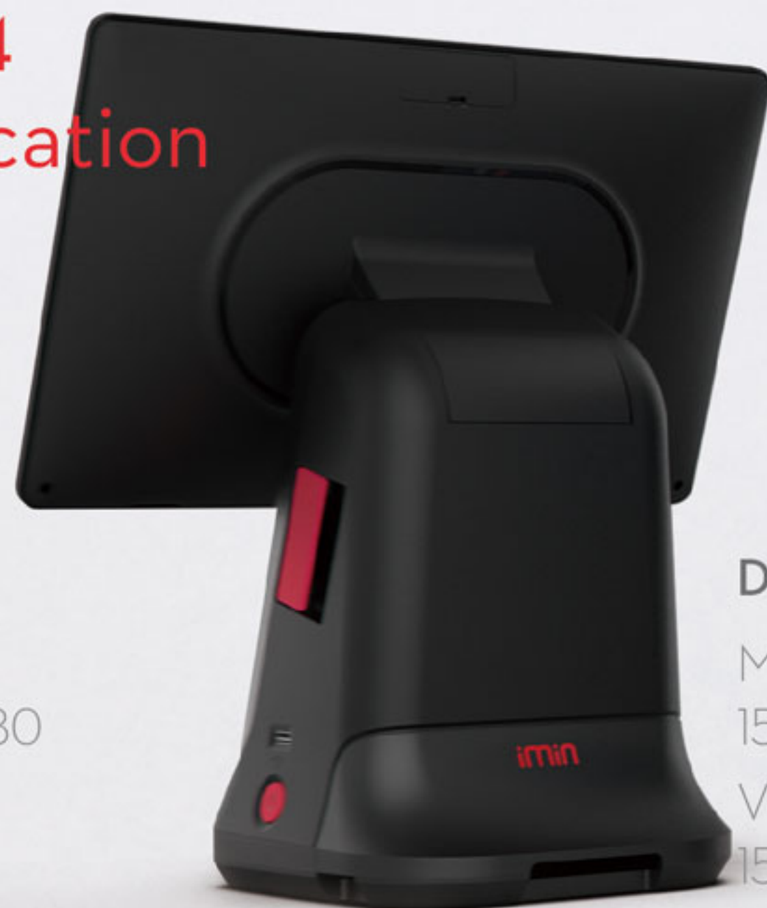
Display 15.6" Main Display: 15.6" 1920x1080