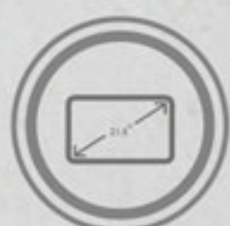
Large screen display